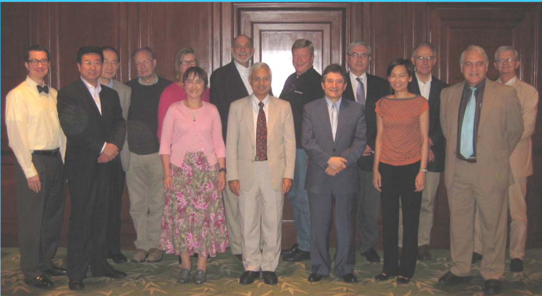
ICRP C3. Annual meeting Hong,Kong 2010 (some members are missing)